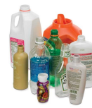
Plastics #1-#7 (Botellas de plastico #1-#7)