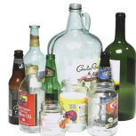
Glass Bottles & Jars (Botellas y frascos de vidrio)