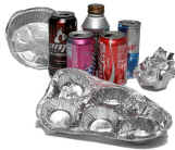
Aluminum Cans & Foil (Latas de aluminio y papel aluminio)