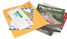
Junk Mail (Correo no deseado)