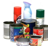
Steel and Tin Cans (Latas de hojalata y fierro)